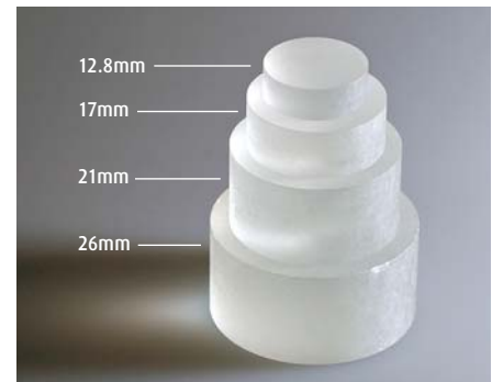
Boston materials are available in a variety of large diameters.