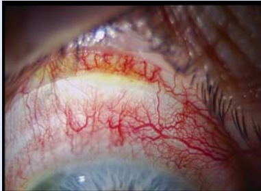
Haptic compression pattern using traditional serial conics.