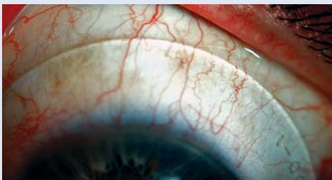
Haptic alignment using spline functions.

Speaking of efficiency, these clinicians agree that you will need more time with your first few scleral lens patients. “Once the first few fits are under the belt, however, the time is comparable to fitting a standard GP lens,” Dr. Jedlicka says. “By the way, for scheduling purposes, I book these patients as complex lens fits like any other complex fit into a smaller-diameter lens.”