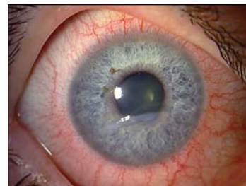
Eyelid Closure Defect After Brain Tumor Surgery

Case 3: A 3-year-old child had eyelid closure defect and corneal exposure keratitis after brain tumor surgery. After 2 weeks of scleral lens wear, the eye was white and the cornea clear (see photos below). Child, parents and clinician are happy.